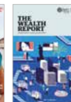
The Wealth Report 2016