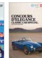
Concours d'elegance 2016