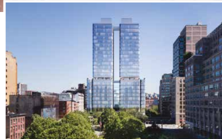
For sale - 565 Broome SoHo, Residences by Renzo Piano Building Workshop. Prices starting from US$ 2,325,000

The attorney will advise when confirmation is received that closings are likely to commence. At this stage, the attorney will coordinate a title search and arrange the purchase of title insurance, as well as provide closing costs estimate, indicating the total sum required to close, including a breakdown of transfer taxes, recording fees etc., and request a transfer of funds to the attorney's escrow account.