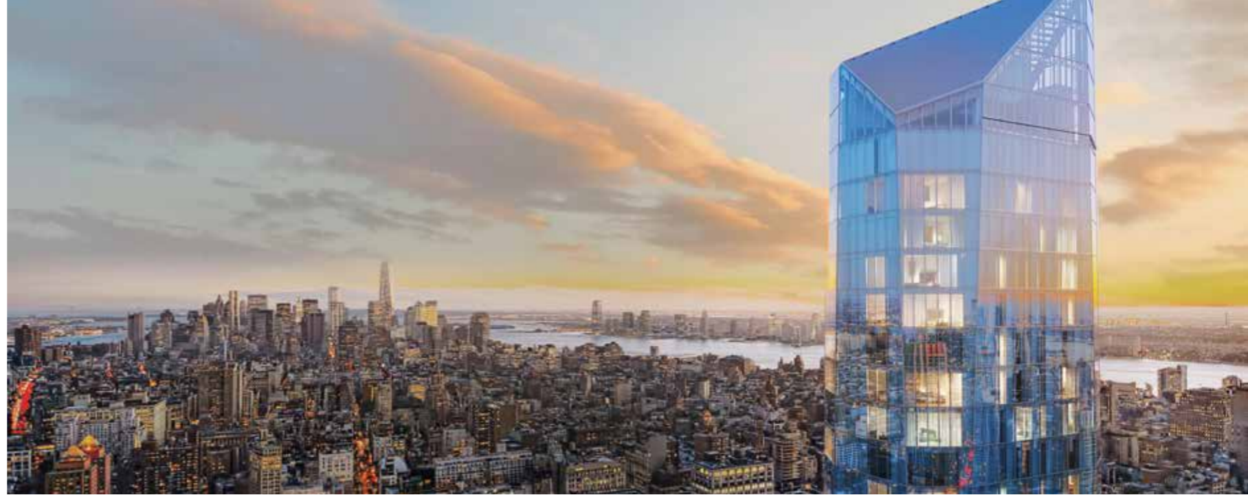
For Sale – 45 East 22nd Street, Flatiron District Prices starting from US$4,975,000

With each new commercial project that Martin Brudnizki takes on – whether it is designing headline-grabbing restaurants such as Sexy Fish in Mayfair, London, hotels including Miami's Soho Beach House or clubs like Annabel's in London – the Swedish interior architect needs to get inside the