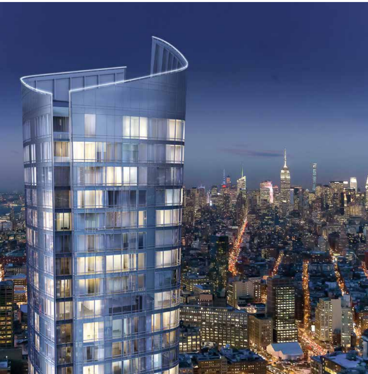
For sale – 111 Murray, Tribeca. Prices starting from US$ 2,500,000