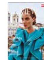
International View 2016